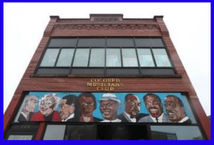
Historic Colored Musicians Club