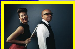
The Baylor Project